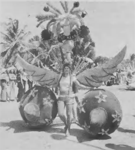
Symbol of Mars